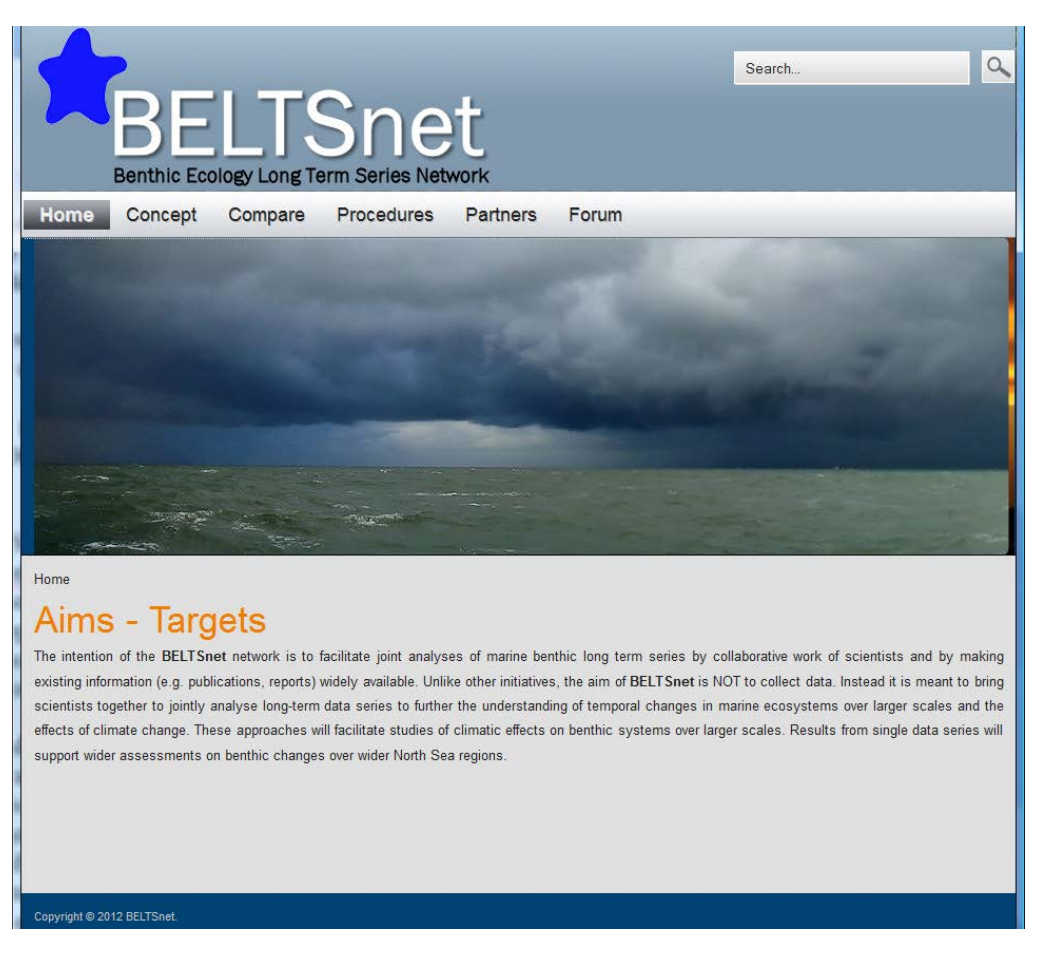
Figure 1. Screenshot of the BELTSnet homepage.

A meta-database structure, based on EML (Ecological Metadata Language) was suggested to avoid difficulties with different file formats.