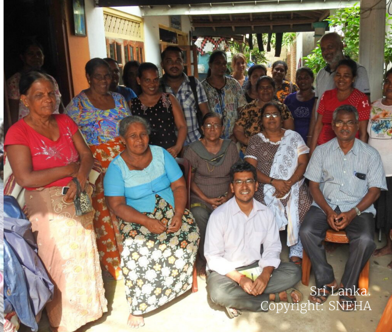
Sri Lanka.