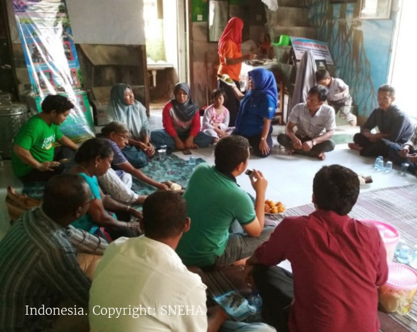
Indonesia. Copyright: SNEHA