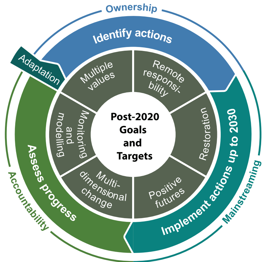
FIGURE 1 Scientific advances of the past 10 years inform a framework for implementation of the post-2020 goals and targets. The framework promotes ownership and mainstreaming, accountability and monitoring of biodiversity and is applicable across sectors and spatial scales

Although the proposed Target 21 (Table 1) recognizes the importance of equitable participation of local communities in decision-making, we argue that recognizing and fostering these different values systems needs to underpin the translation and implementation of the entire post-2020 set of goals and targets. This would increase acceptance, own-